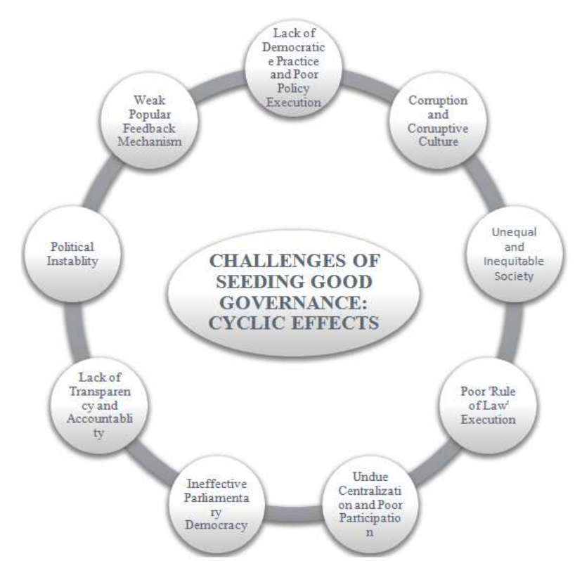
Figure 5.1: Cyclic Effects of the challenges of seeding Good Governance

In fine of the study performed it's clear that the challenges of good governance are interrelated and interconnected. One challenge sometimes boosts or initiates another like the Vicious Circle prescribed by Prof. RagnarNurkse and a challenge fulfilled alone can't bring about the result expected. Here we see how the challenges interact and initiate another-